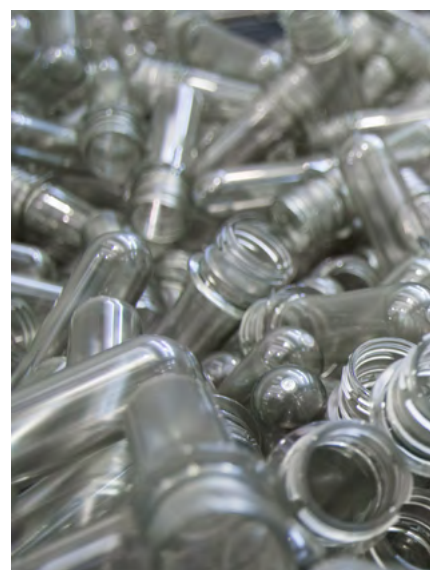
Preforms (raw) for beverage bottles made of PET recyclate

Flustix Recycled Certification offers you a unique opportunity to stand out from competitors through accredited testing. We look forward to hear from you!